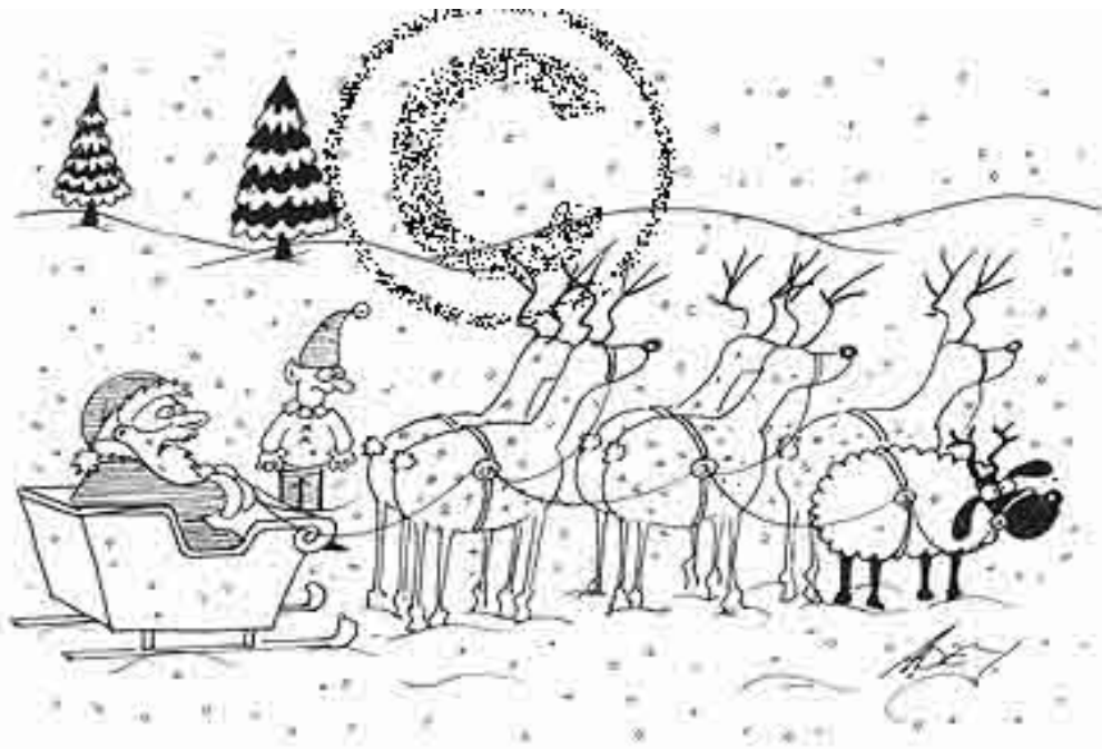
"Rudolph's not very well, so I've had to get someone in from the agency."